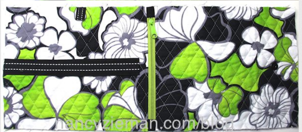
Open zipper. Meet fabric edges right sides together. Stitch side seams and lower edge. Turn right side out.